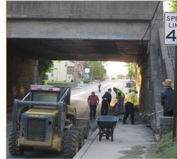
The annual Town Cleanup Day in Bird-in-Hand was held on Saturday, May 31. The crews typically start at 6 am when traffic is not heavy. When there is a good turnout, the project takes 1½ hours.