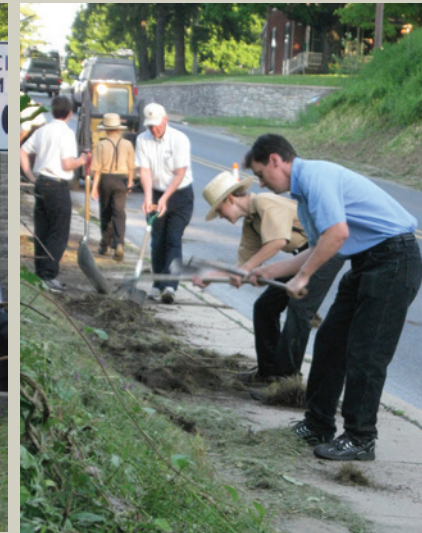
Nineteen workers and two fire police were on hand in 2014. This is an event where young and old work together. Ages ranged from 13 to 68. Two crews worked on the south and north sides of the Old Philadelphia Pike.