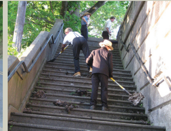
The starting place is at the Fire Hall and the crews work their way through town to Maple Avenue. They make sure the railroad underpass, stairways, and sidewalks are clean for another year and enjoy coffee and doughnuts at the Fire Hall when they are finished.