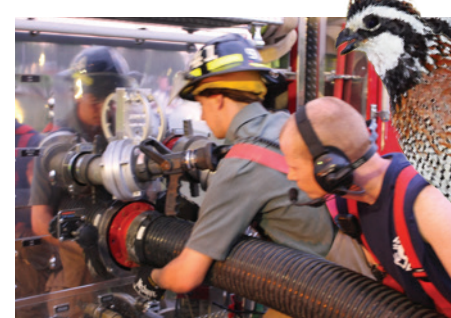
During training, these firefighters are connecting hard sleeve to draft water out of a creek.