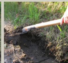
Town Cleanup Day was started as a Boy Scout's project with a few community people helping him. The first year three dump truck loads were hauled away because, except for six inches at the edge, the sidewalks were covered with grass and weeds. The cleanup was a big part of the preparation for the 250th Anniversary of Bird-in-Hand in 1984.